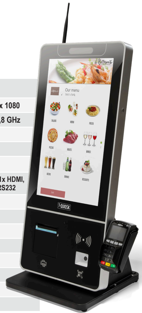
T-Q1 model fitted with desktop and pinpad support