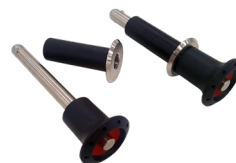
Removable anchor system (optional)