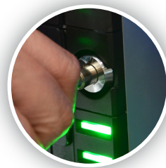
Internal access blocks to cash