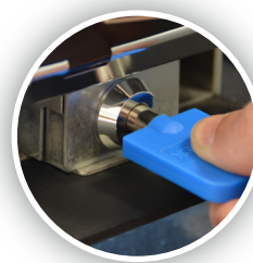
Internal access blocks to cash (optional)